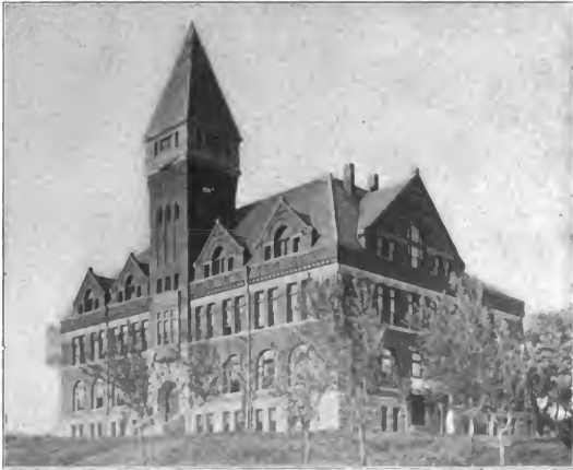
MAIN BUILDING, FAIRMOUNT COLLEGE.

Wichita, the second largest city in Kansas, is the judicial seat of Sedgwick county, in the southern part of the state. It is located 230 miles from Kansas City on the Arkansas river, and is one of the most important railway centers in Kansas, having direct connections with almost every city west of the Mississippi. Five roads—the Missouri Pacific, Atchison, Topeka & Santa Fe, Chicago, Rock Island & Pacific,